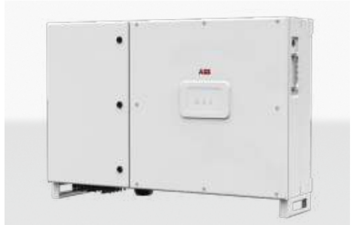
ABB string inverters PVS-60-TL