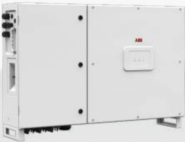
— PVS-60-TL string inverter

This new addition to the PVS string inverter family, with 3 independent MPPT and power ratings of up to 60 kW, has been designed with the objective to maximize the ROI in large systems with all the advantages of a decentralized configuration for both rooftop and ground-mounted installations.